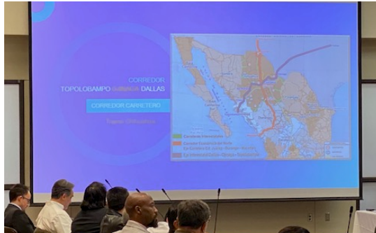
Presentation by State of Chihuahua.