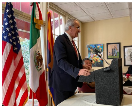
Under Secretary Seade provides remarks during luncheon