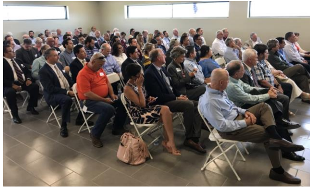
Audience during NAFTA Seminar