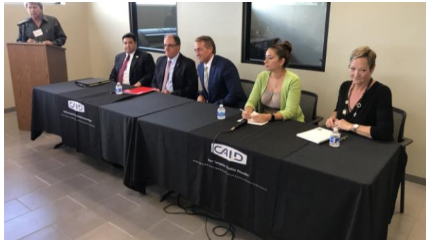
Panel during the NAFTA event